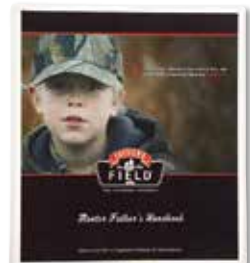
FitF Binder for Mentor Father