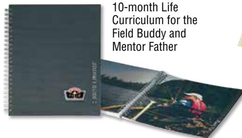
10-month Life Curriculum for the Field Buddy and Mentor Father