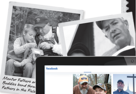
Mentor Fathers and Buddies bond through Fathers in the Field

Availability is limited, so please call immediately if you are interested. Program ages (7- 17yrs). Call Fathers in the Field at 332-0901. Sponsored by Covenant Presbyterian Church and the Wind River Community Church.